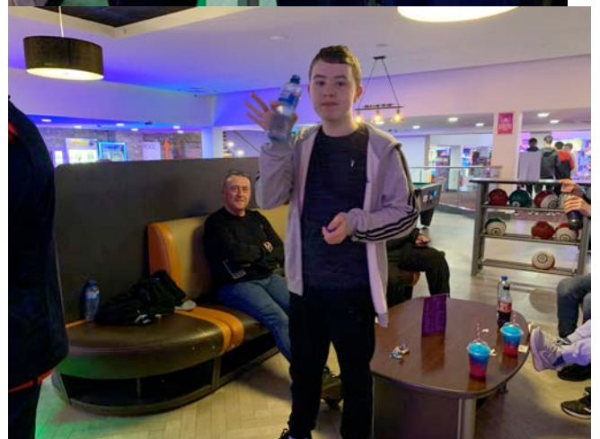
After their Service and Display the Boys enjoyed a night ten-pin bowling